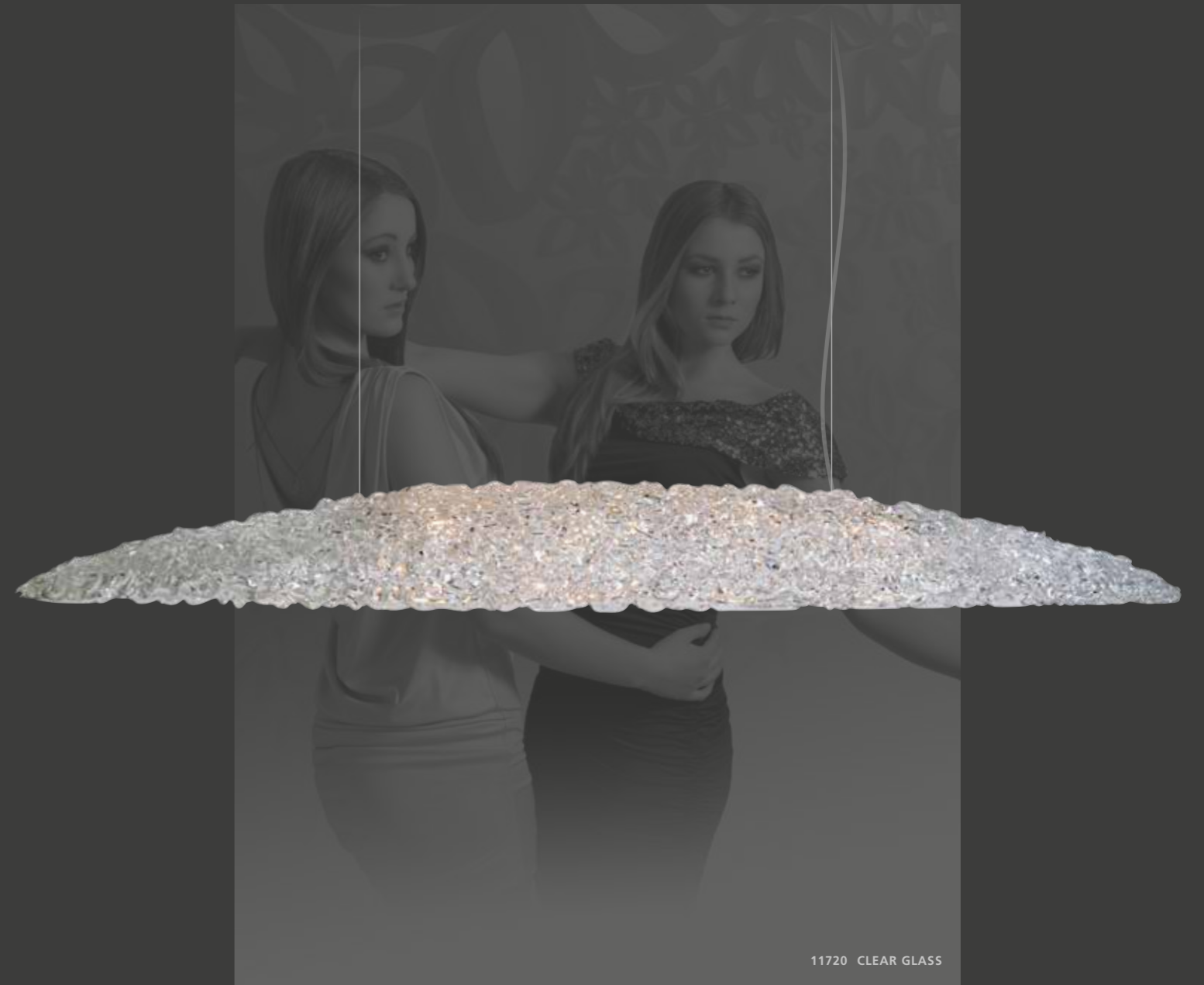
11720 CLEAR GLASS

GENERAL INFORMATION: - ALL GLASS IS ITALIAN HANDMADE AND EVERY PIECE IS UNIQUE - OTHER COLORS FOR METAL PARTS ON REQUEST