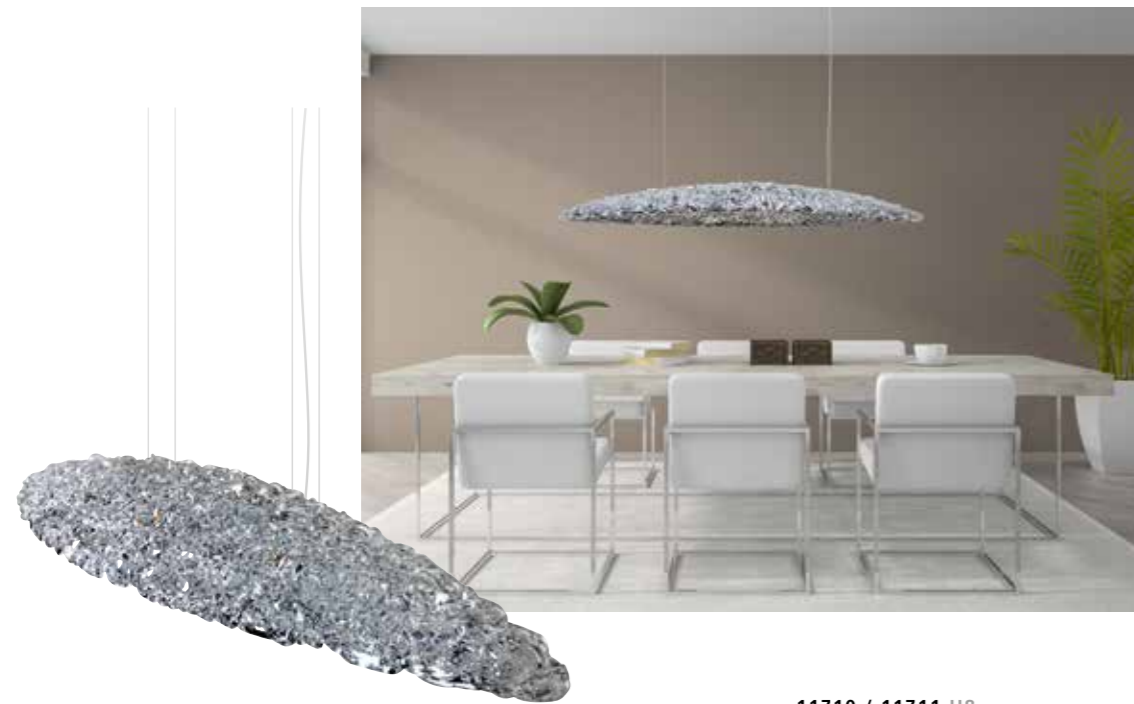
11721 SILVER GLASS

NIGHT IN PARIS IS A REGISTRATED DESIGN BY COEN MUNSTERS 2011